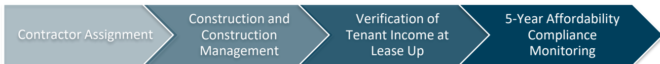
Figure 2: Construction and Compliance

The construction and compliance phase, as seen in Figure 2, is where repair, reconstruction, or replacement assistance is provided to the property owner through direct construction activities performed by the program and the result is a rehabilitated housing unit. After final construction activities and the completion of any compliance period, the grant will be closed out – meaning that all required documentation for HUD compliance and record-keeping will be completed.