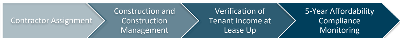
Figure 2: Construction and Compliance

The construction and compliance phase, as seen in Figure 2, is where repair, reconstruction, or replacement assistance is provided to the property owner through direct construction activities performed by the program and the result is a rehabilitated housing unit. After final construction activities and the completion of any compliance period, the grant will be closed out – meaning that all required documentation for HUD compliance and record-keeping will be completed.