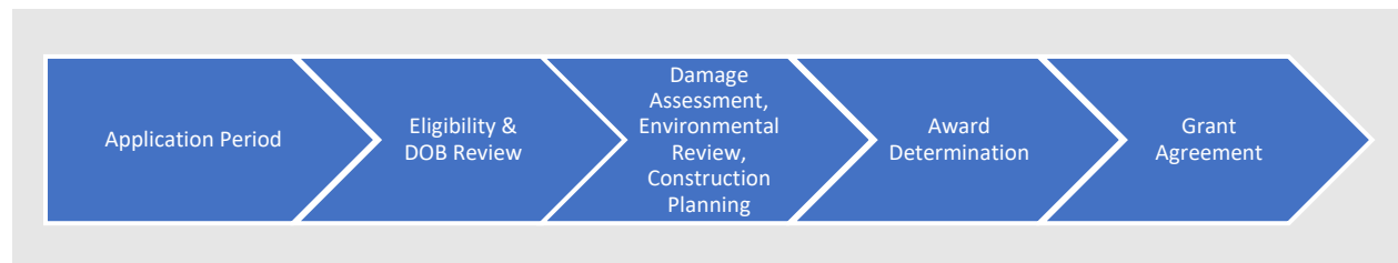
Figure 1: Initial Application and Documentation Steps

The process includes homeowners completing application period by submitting initial eligibility documentation that are required to advance to an award of benefits to eligible homeowners. Following successful eligibility and duplication of benefits (DOB) review, the result of the initial eligibility-documentation phase is the advancement to the assessment phase, where program staff will conduct a damage assessment, environmental review, and develop Estimated Cost of Repair (ECR) for repairs or replacement. The ECR is then used to develop the Award Determination (repair, reconstruction, or replacement), which is then followed by the signing of a grant agreement.