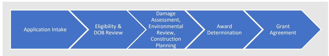
Figure 1: Initial Application and Documentation Steps

The federal requirements for the delivery of construction assistance under the HRRP are complex and will require a multi-step process (see Figures 1 and 2 below) to ensure compliance with all regulations and requirements tied to the funding source. With the assistance of staff and vendors, the state will work with a pool of qualified and procured contractors that will be assigned by the program to repair, reconstruct, or replace damaged properties. Rental property owners will complete applications and submit eligibility documentation that are required to advance to an award of benefits to eligible rental property owners. Following successful eligibility and duplication of benefits (DOB) review, the result of the initial eligibility-documentation phase is the advancement to the assessment phase, where program staff will conduct a damage assessment, environmental review, and develop the scope of work (SOW) for repairs needed (or reconstruction or replacement). The SOW is then used to develop the Award Determination – e.g. the type of repair activity available to the rental property owner, which is then followed by the signing of a loan agreement.